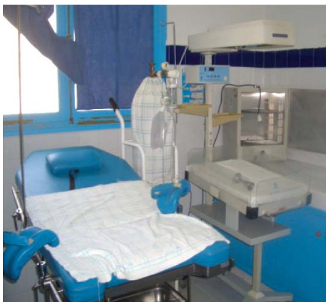
Photo: Delivery Room Renovations to Promote Privacy and Quality of Care